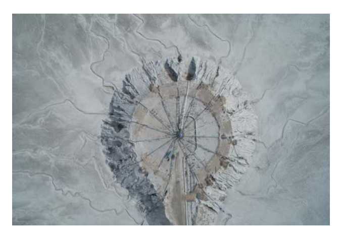
Aktogay tailings storage facility

Bozshakol has successfully found a market for many of its waste products, including plastic, scrap metal, paper, cardboard and grinding balls. Not only does this reduce the volume of materials going to landfill, but it also helps to support small and medium-sized businesses in the region, as well as the local people they employ. Additionally, the Group is able to avoid the greenhouse gas emissions which have been generated by disposing of the waste in landfill.