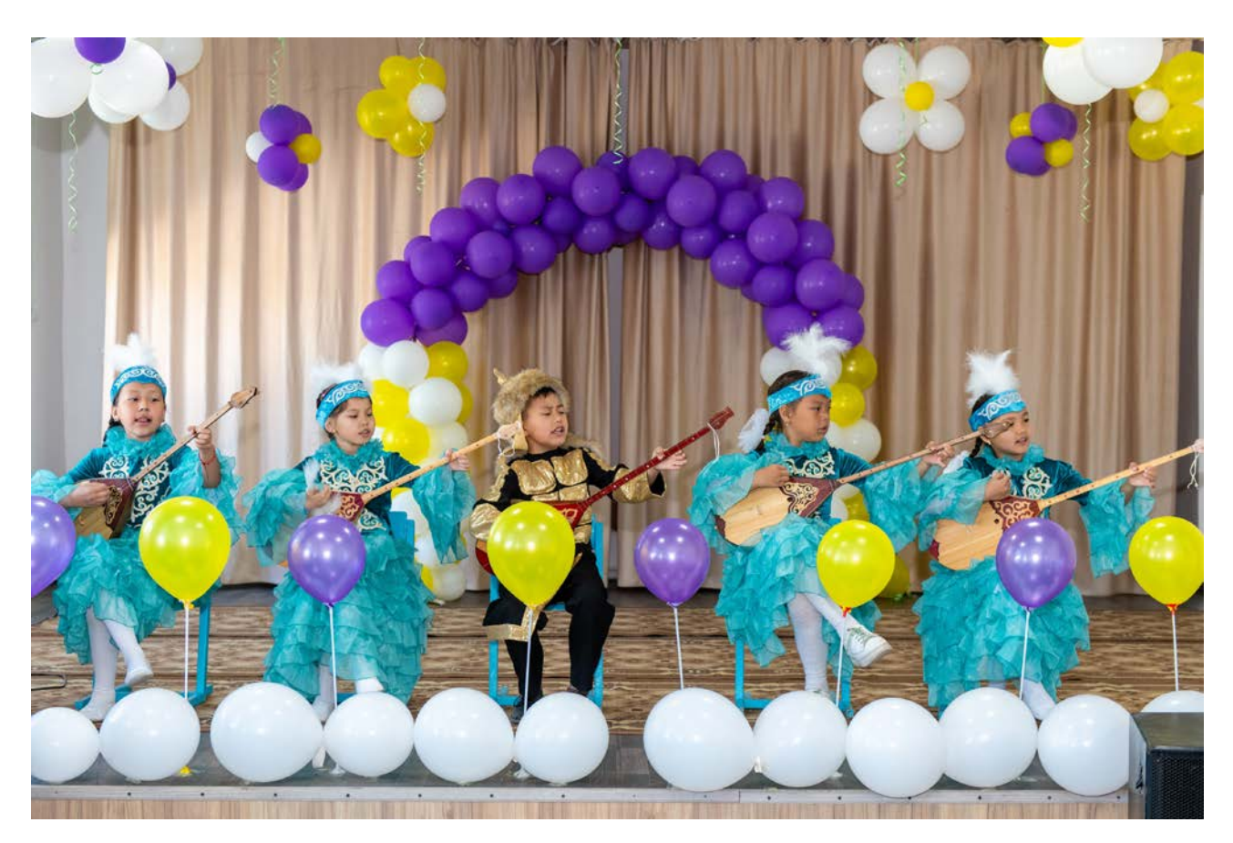
School children from the Aktogay village performing on the dombra, a Kazakh stringed instrument. The Group provides funding and support to local educational institutions.

The Group has invested over $5 billion in the construction of new mining facilities in Kazakhstan from 2011 to 2021, principally at its Aktogay and Bozshakol sites. The Aktogay expansion project was opened in October 2021 by the President of Kazakhstan and the Group expects to make around $100 million of finalisation payments to contractors in 2022.